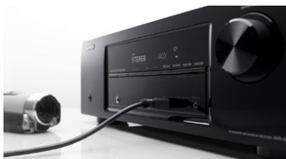
Convenient HDMI port on the front

When you set the Sleep Timer and listen to music before you fall asleep, the AVR-1513 will automatically go into standby mode in the time that you set.